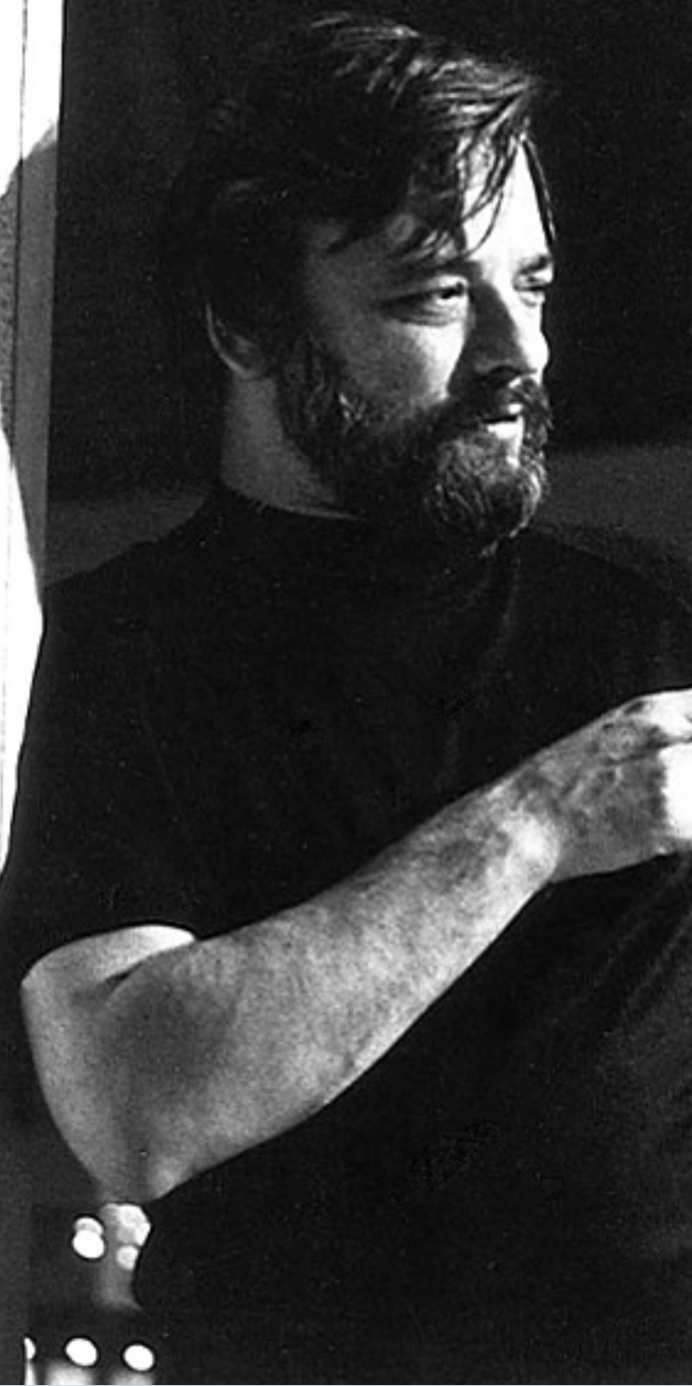
Stephen Sondheim in a photograph by an unknown photographer, RR Auctions, Public Domain