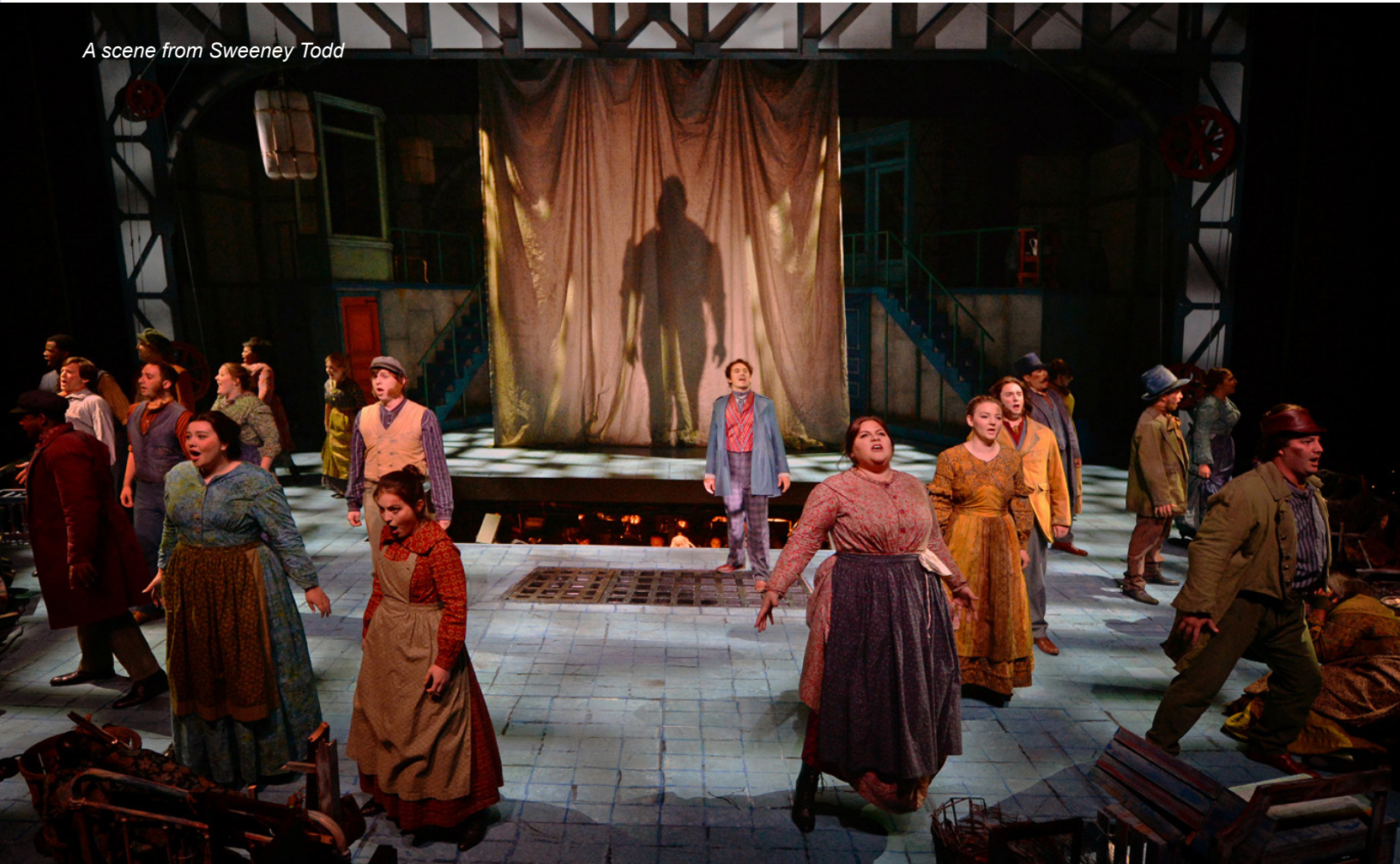
A scene from Sweeney Todd

There are always exceptions to the rule: though Les Misérables is through-sung it is still classified as a piece of musical theatre because of its style of music. By the same token, some operas, like Mozart's The Magic Flute , have spoken dialogue in addition to singing.