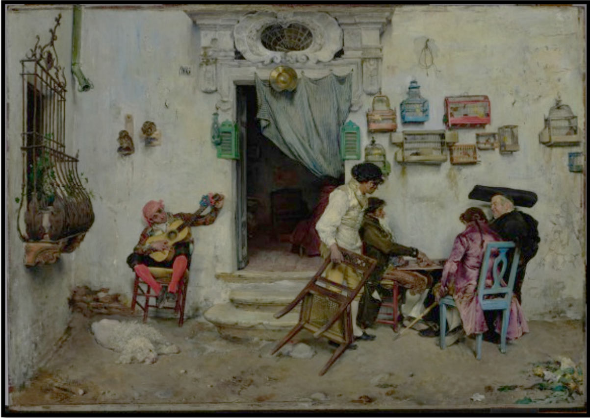
Figaro's Shop by Jose Jiménez Aranda (click to view full screen artwork)

Jiménez was an artist from Seville, Spain. He displayed remarkable technical skills and humor in his paintings of everyday life. He was born in Seville, Spain in 1837 and died in 1903.